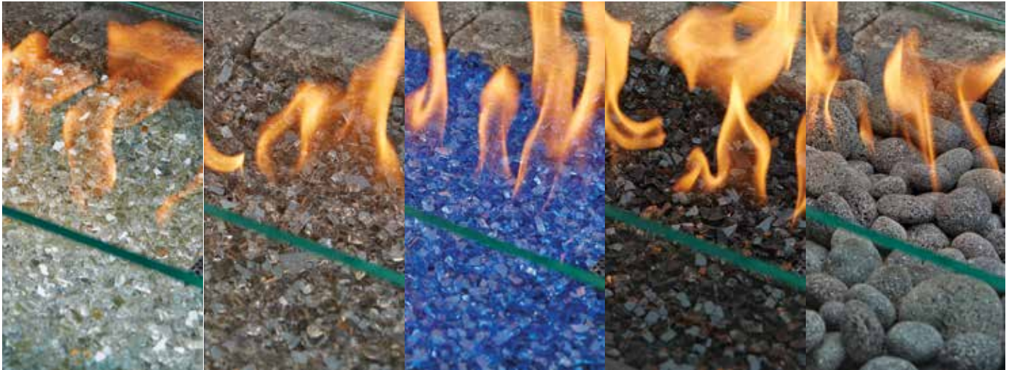
PLATINUM CRUSHED GLASS

Explore our extensive array of Crushed Glass and Stone medias. You're sure to discover the ideal match to the ambiance you seek to evoke in your personal Fire Garden. Available for all models except the 4035 Traditional Gas Fireplace, and Tempest Torches & Lanterns.