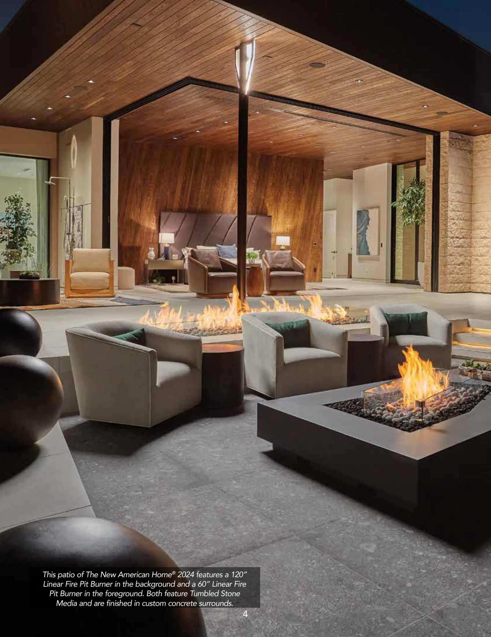
This patio of The New American Home® 2024 features a 120" Linear Fire Pit Burner in the background and a 60" Linear Fire Pit Burner in the foreground. Both feature Tumbled Stone Media and are finished in custom concrete surrounds.