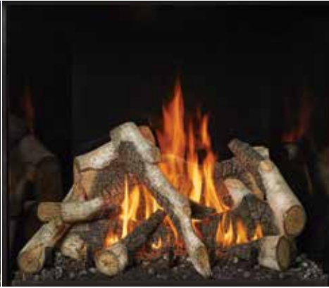
Birch Log Set