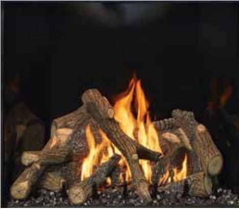
Oak Log Set