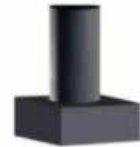
PILLAR MOUNT 3" x 11"