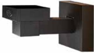
LANTERN WALL MOUNT