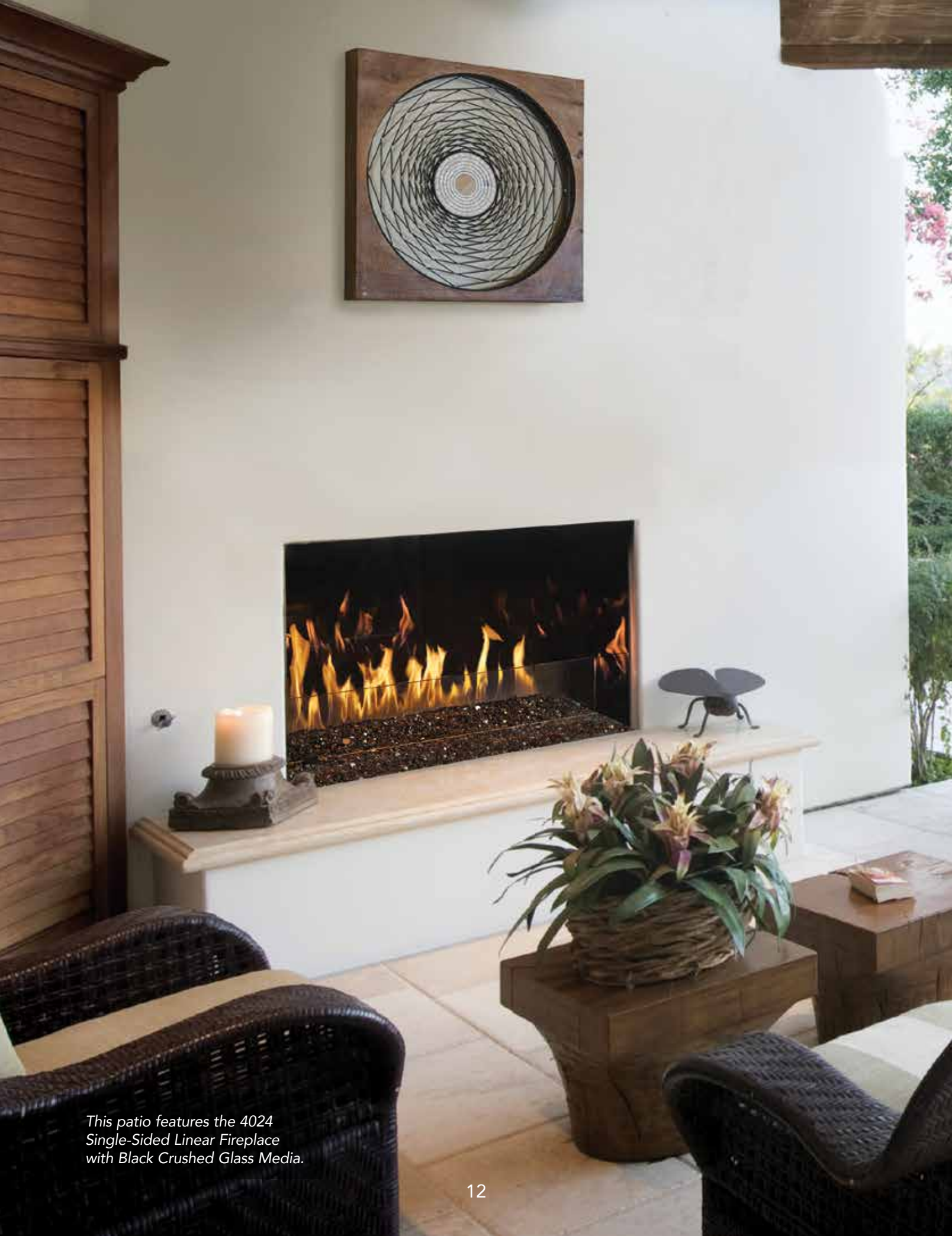
This patio features the 4024 Single-Sided Linear Fireplace with Black Crushed Glass Media.