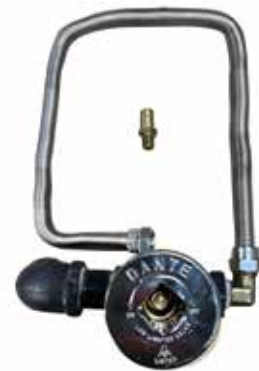
Hard Pipe Kit - NG/LP