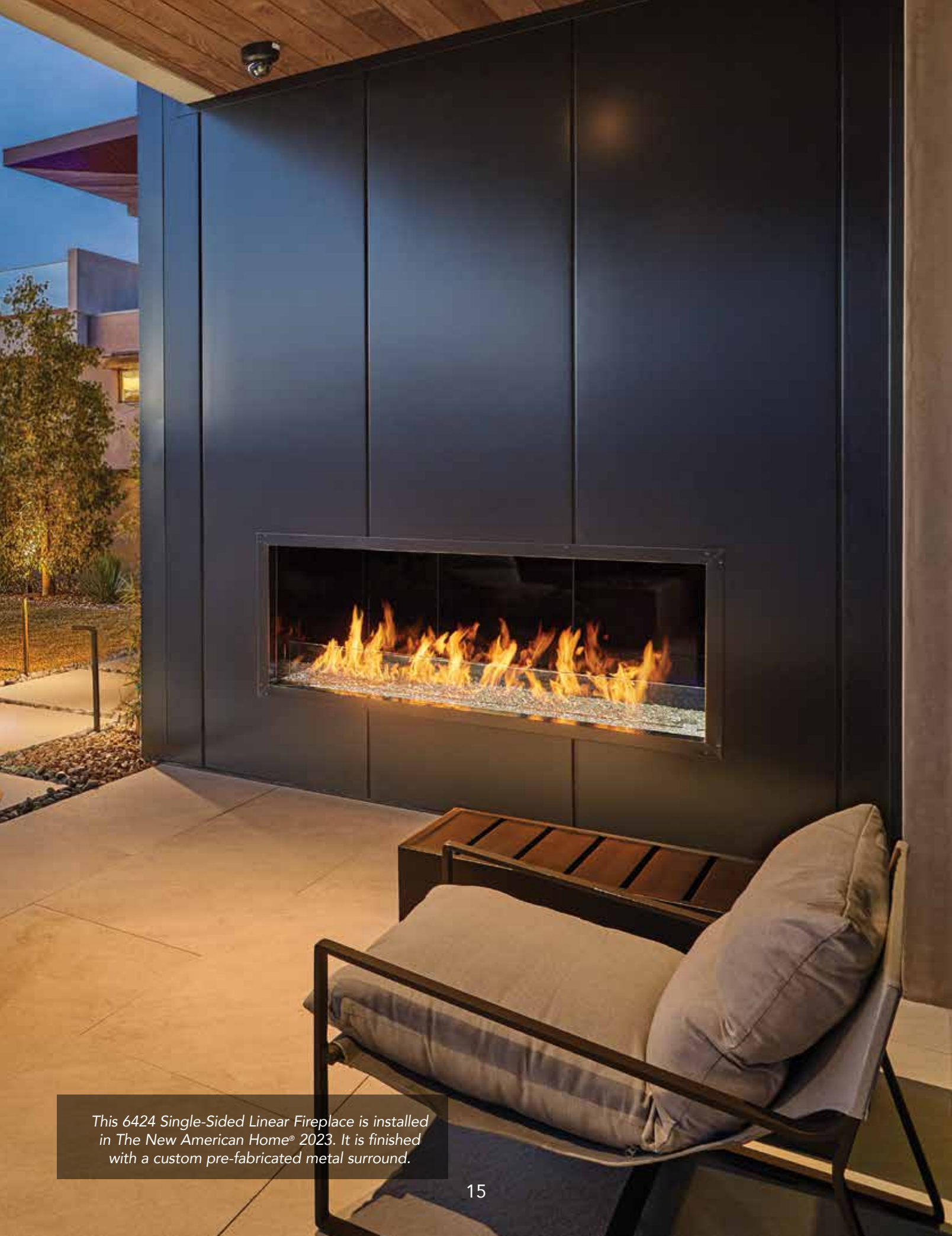
This 6424 Single-Sided Linear Fireplace is installed in The New American Home® 2023. It is finished with a custom pre-fabricated metal surround.