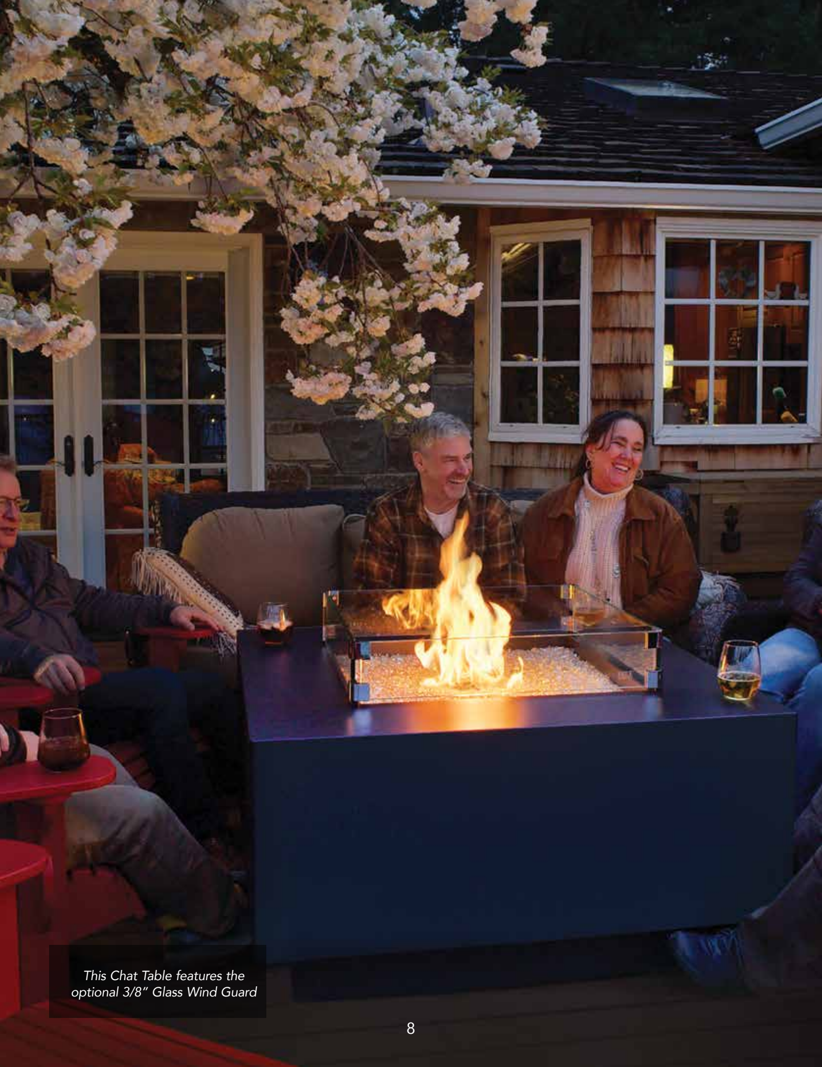
This Chat Table features the optional 3/8" Glass Wind Guard