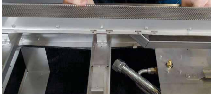
Above: A closer look at the heavy-duty stainless steel construction of our Linear Fire Pit Burner

is resistant to corrosion, heat, and weather elements, ensuring long-lasting performance and peace of mind.