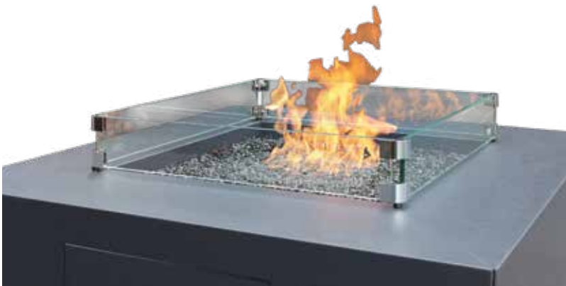
3/8" Glass Wind Guard