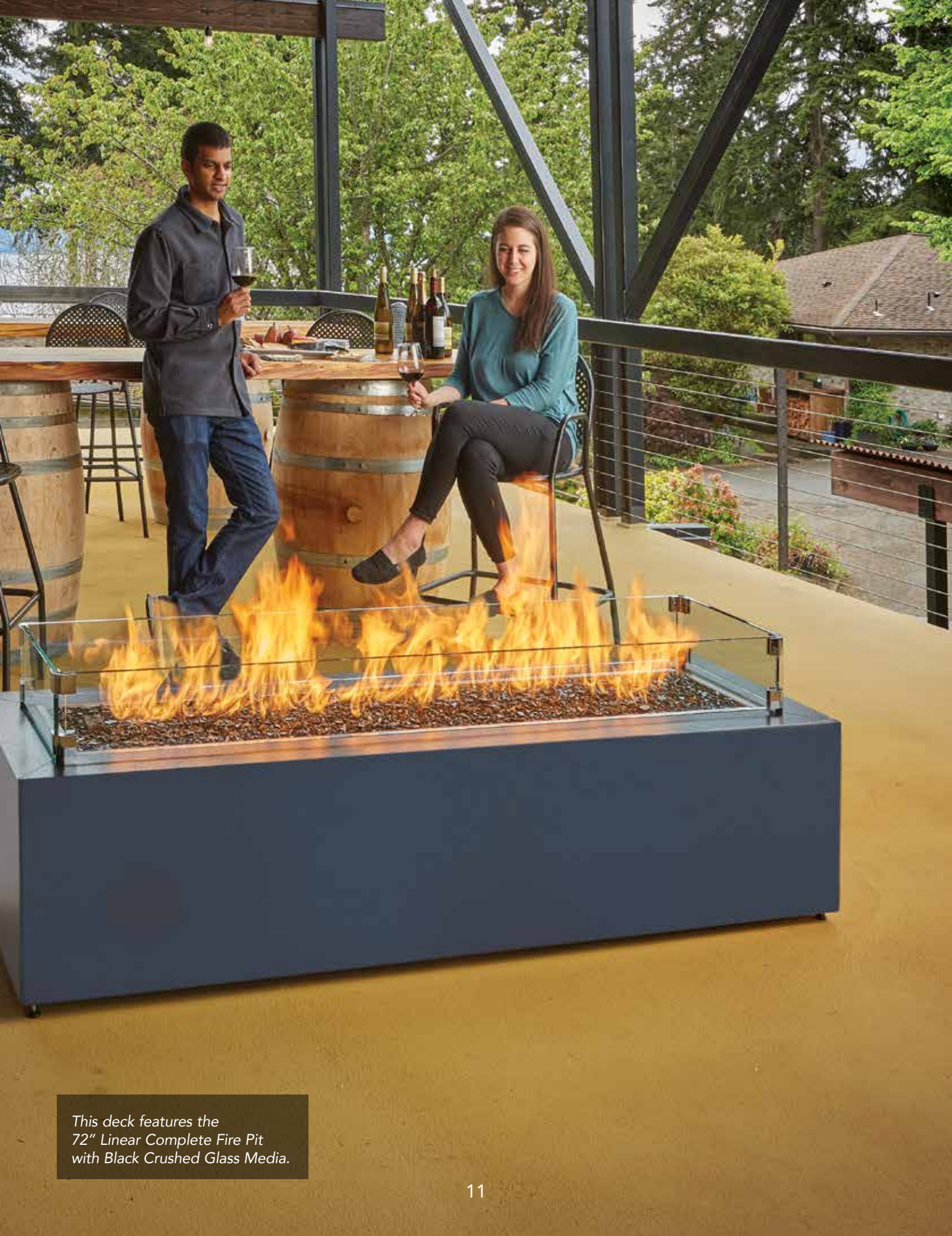
This deck features the 72" Linear Complete Fire Pit with Black Crushed Glass Media.