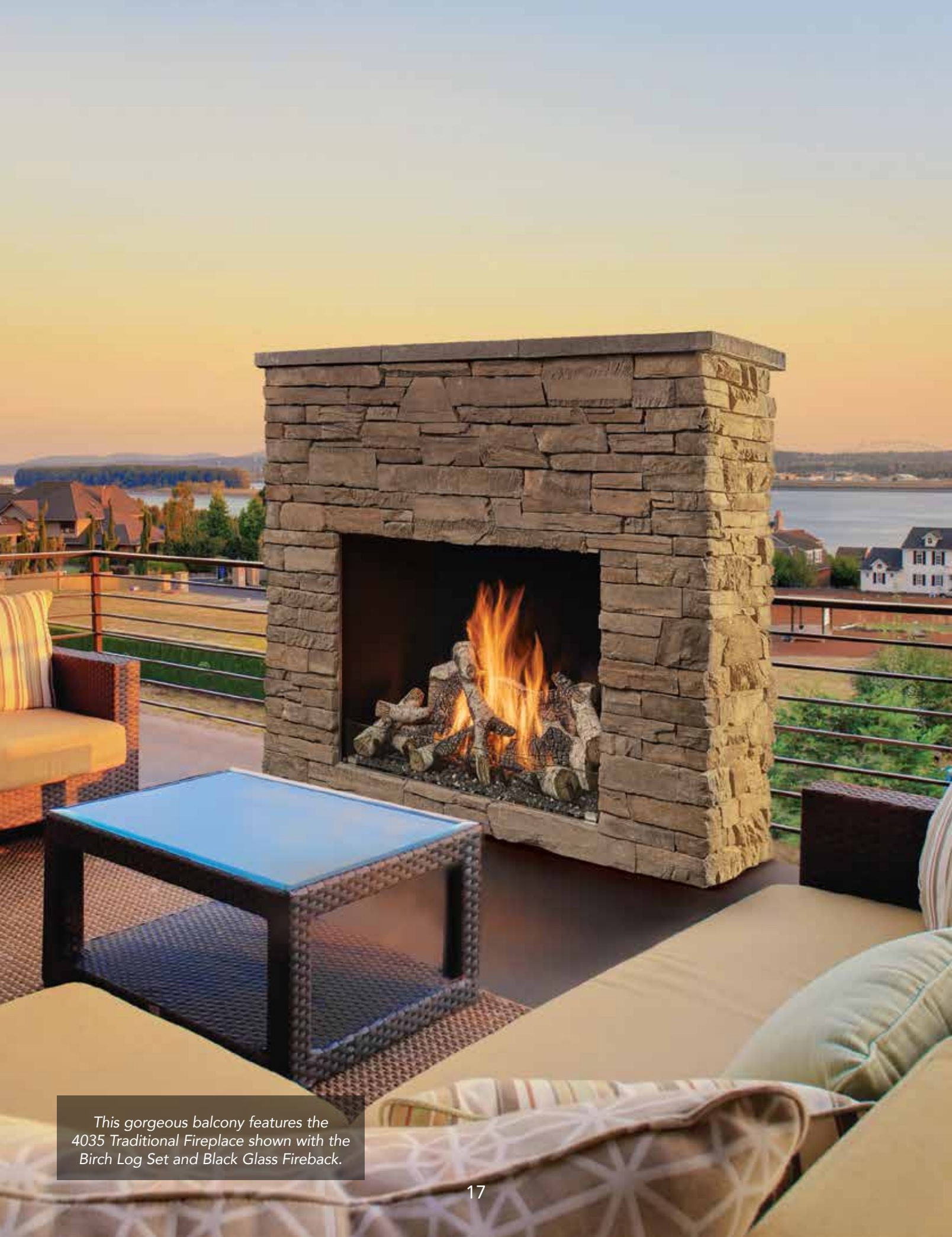
This gorgeous balcony features the 4035 Traditional Fireplace shown with the Birch Log Set and Black Glass Fireback.