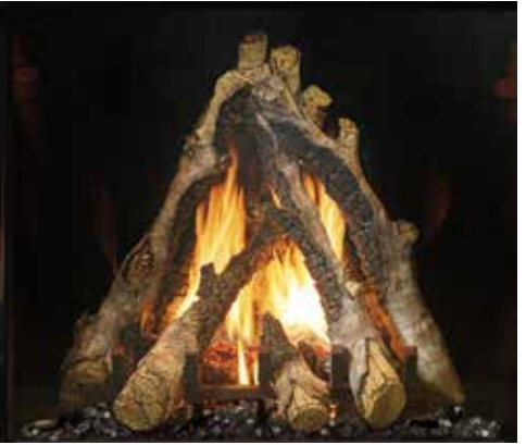
Bon-Fyre™ Birch Log Set